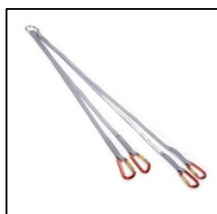
Four Point Lifting Sling

For simple cleaning and enhanced infection control, the flaps are wipe-clean and the patient pads may be simply detached from the base.