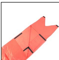
Foul Weather Sheet