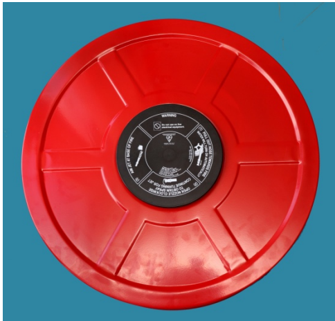
Fixed Hose Reel