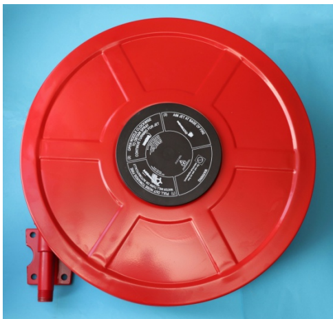
Swinging Hose Reel