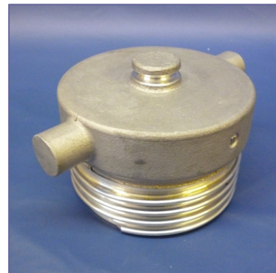
4" male round thread