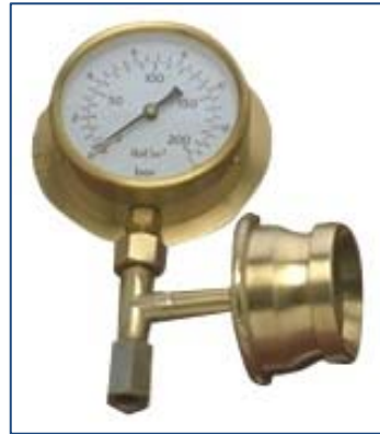
2 1/2" male instantaneous c/w pressure gauge