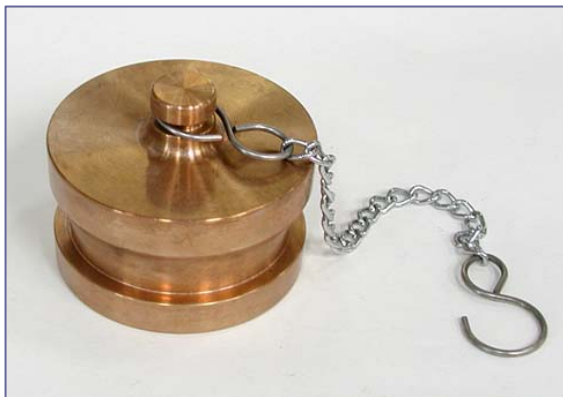
2 1/2" male instantaneous