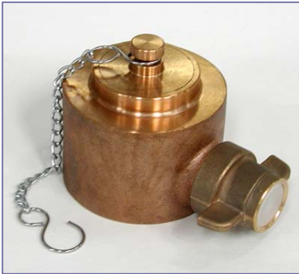
2 1/2" female instantaneous single twist

When ordering, the type and size of connection, plug, or cap, standard or vented, should be specified.